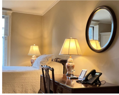
TOWN ROOM 1 Queen Bed