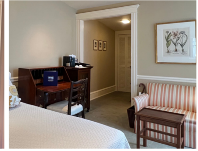
WILLIAMSBURG ROOM 1 King Bed

Four elegant guest rooms are offered for Sunset Club members and guests. Relax in a city oasis with classic furnishings, luxurious bedding, with space for work or play. Enjoy the convenience to downtown shopping, museums and galleries. Ideal for wedding parties or special events.