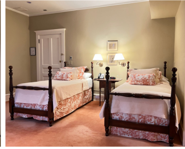
WASHINGTON ROOM 2 Twin Beds