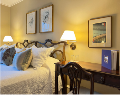
LEXINGTON ROOM 1 King Bed